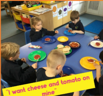
"I want cheese and tomato on mine"