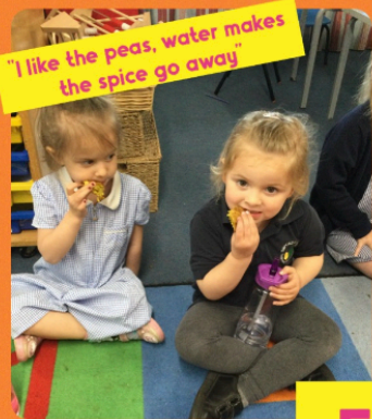
"I like the peas, water makes the spice go away"

This term we have been having great fun travelling 'Around the World' for our topic. Each week we've boarded 'Acorn Airways' and jetted off to a new continent, meeting different animals, site-seeing, experiencing different cultures through art and tasting different foods. Come journey with us as Acorn Class 'goes global'!