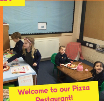
Welcome to our Pizza Restaurant!

Fantastic Foodies The children have enjoyed trying foods from all over the world. From making their own pizzas (both real and pretend in our popular pizza parlour) to spicy Indian delicacies and sweet Canadian pancakes with maple syrup - the Acorns have had their tastebuds truly tickled!