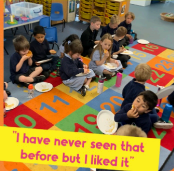
"I have never seen that before but I liked it"