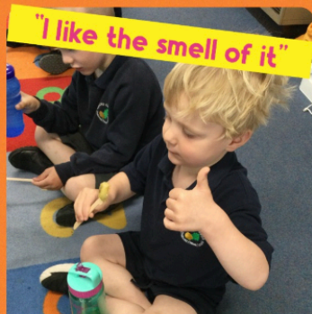
"I like the smell of it"