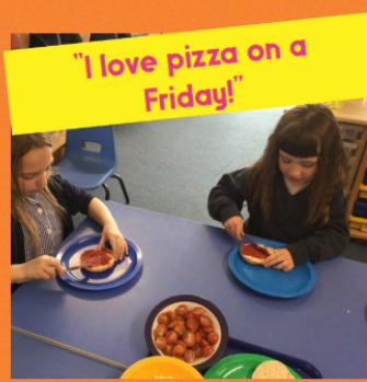
"I love pizza on a Friday!"